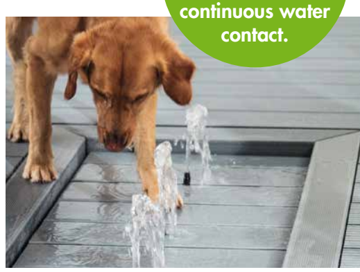
UPM ProFi Deck is ULTRA-DURABLE whether on the ground, in the ground or underwater. UPM ProFi®